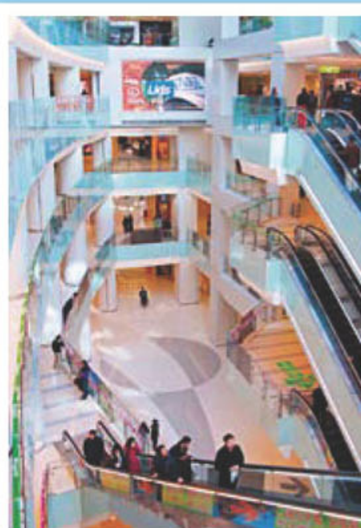
The newly renovated of Beijing apm is timed to coincide with the Beijing Olympic this year.

SHKP has always been dedicated to quality and bringing the best experience to